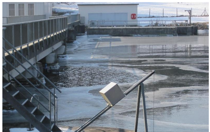
02/28/2018 All 4 dam shutters in the picture only with OLOID ice-free