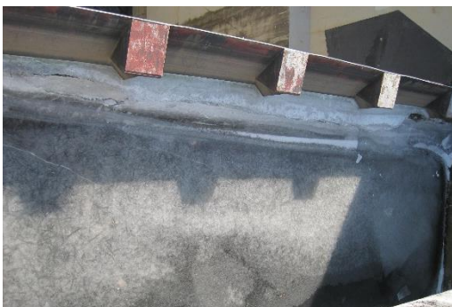
02/28/2018 Dam shutter without OLOID for comparison