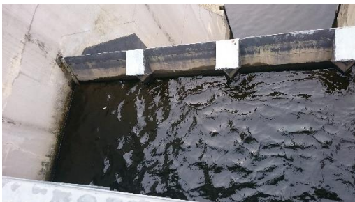
02/15/2018 Dam shutter with OLOID ice-free