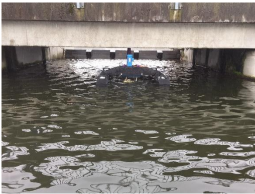
01/23/2018 OLOID Type 400 with flow direction to the dam shutter